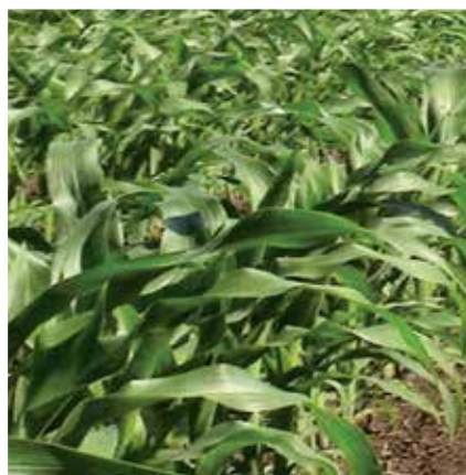
Field with starter, Foliar Opp® Corn, and SRN