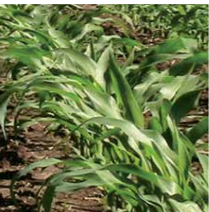
Field with starter only