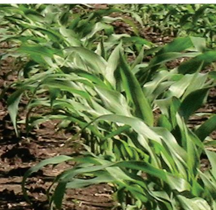
Field with starter only