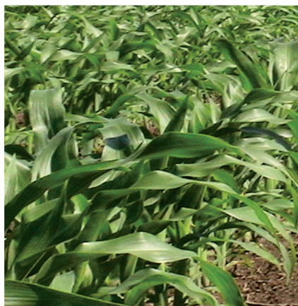
Field with starter, Foliar Opp Corn ® , and SRN