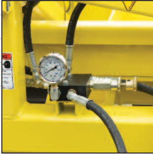
Wing Down Pressure Valve