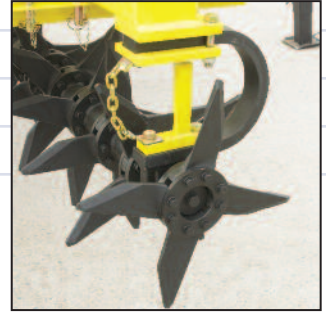
C-Flex with Outboard Star Design