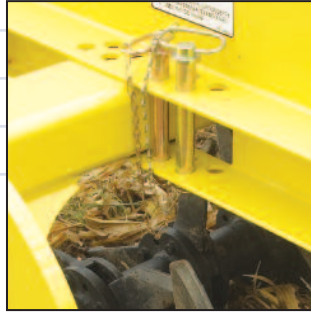
Quick Adjust Swing Arms