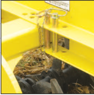
Quick Adjust Swing Arms