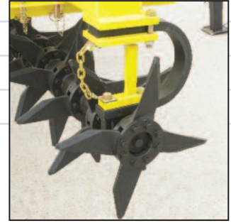
C-Flex with Outboard Star Design