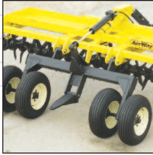
Optional Pull Type Wheel Kit